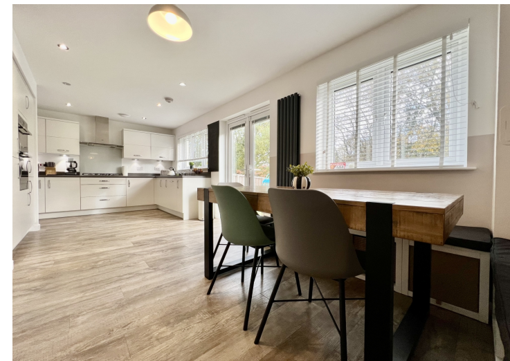
Rosemont Place, Barrhead, Glasgow