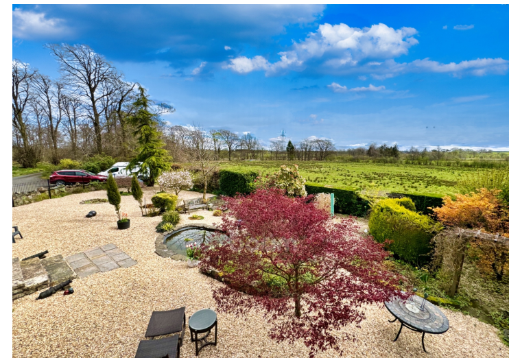
Laigh Maulside, Beith