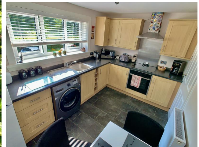
5 Park View, Paisley