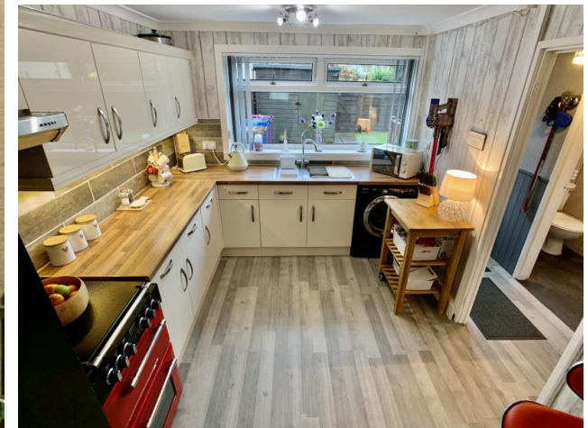
16 Garrallan, Kilwinning