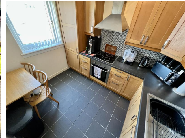
42D Sharon Street, Dalry