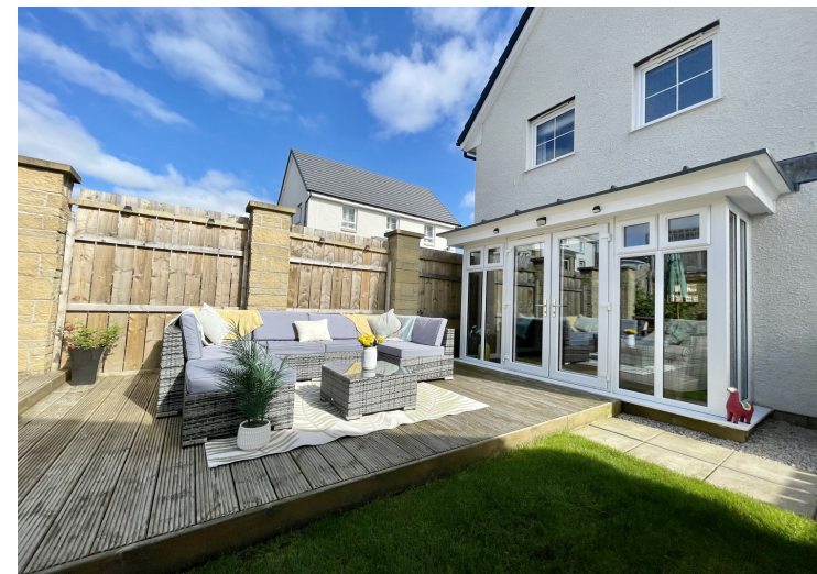
20 Glendale Wynd, Brookfield