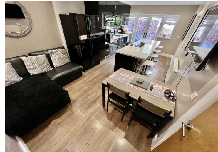
4 Duffield Drive, Largs