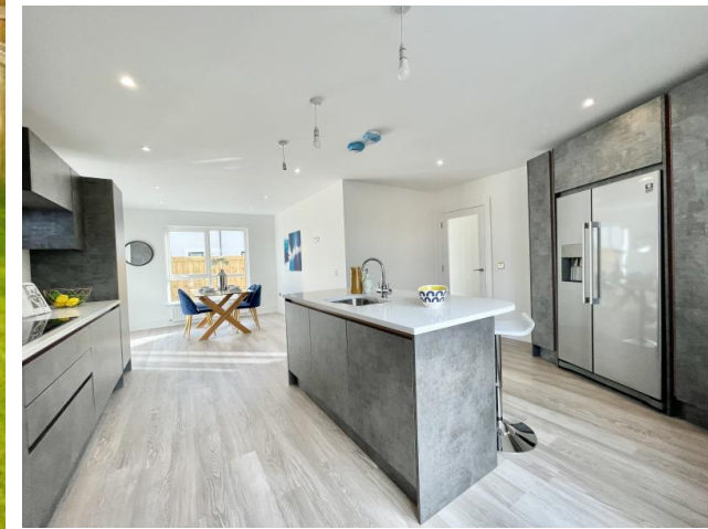
No. 10 Chapel Farm Steading, Chapel Road, Houston