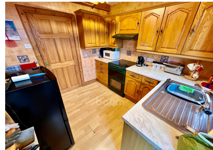
Flat 1 Lendal Cottage, Mill of Gryffe Road, Bridge of Weir