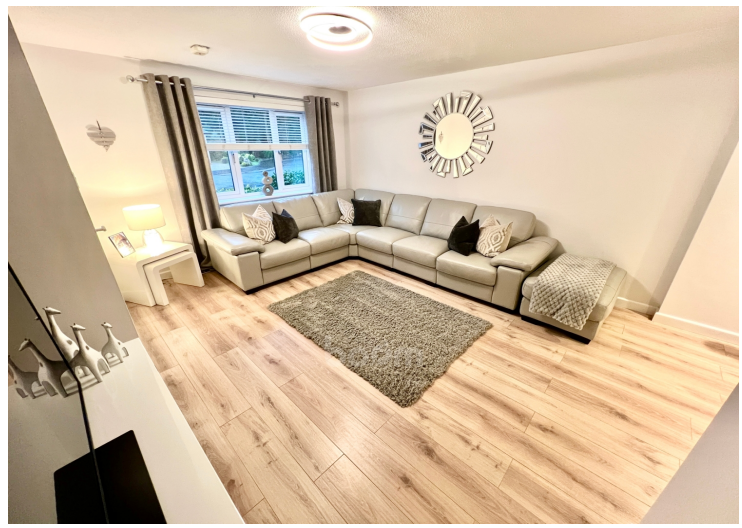
50 Dennyholm Wynd, Kilbirnie