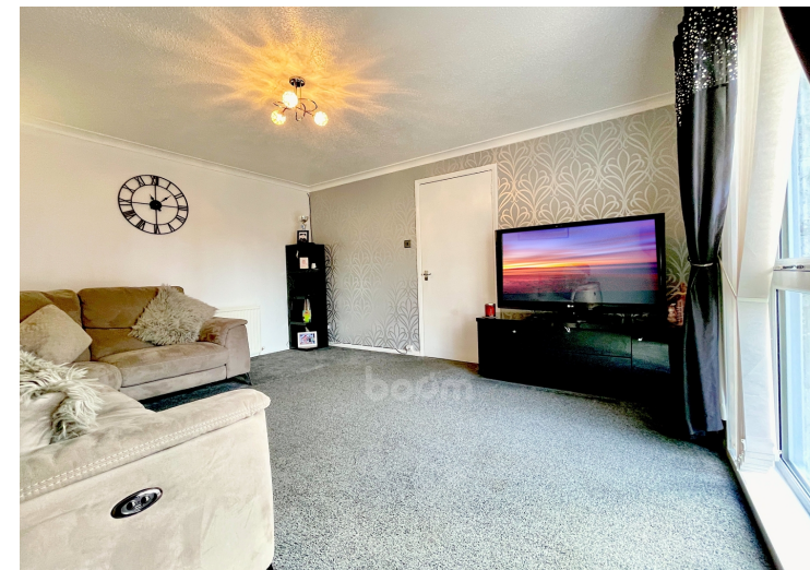
7 Kings Court, Beith