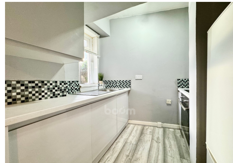
14 Crummock Street, Beith