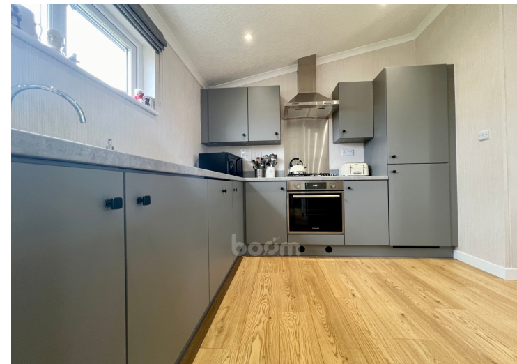
24 Heather Bank Park, Neilston