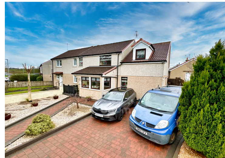
6 Stoopshill Crescent, Dalry