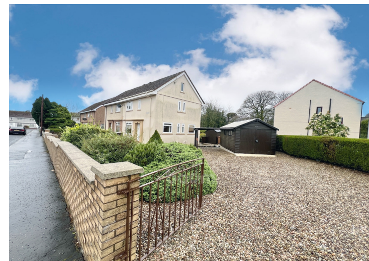
2 Plan View, Kilbirnie