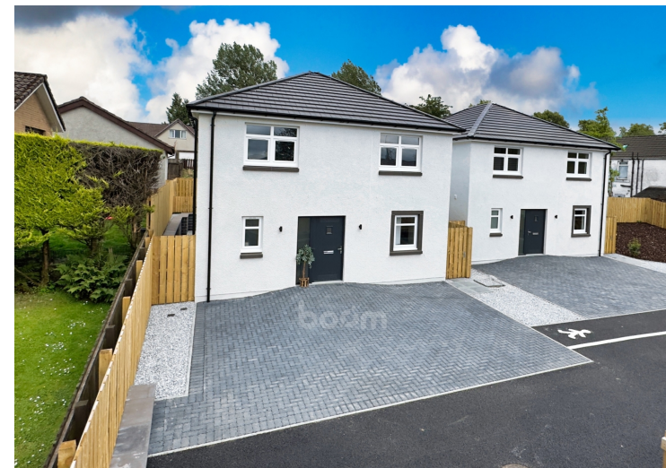
Eglinton Gardens, 37 Head Street, Beith