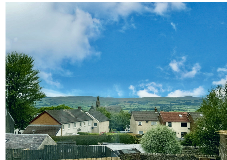
Eglinton Gardens, 39 Head Street, Beith