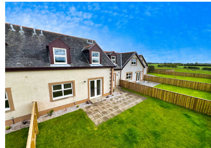
7 Selvieland Farm Cottages Houston Road, Houston