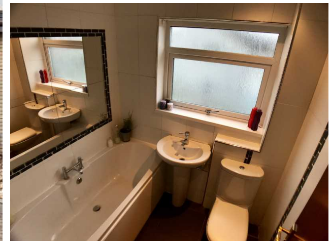
Aitken Drive, Beith