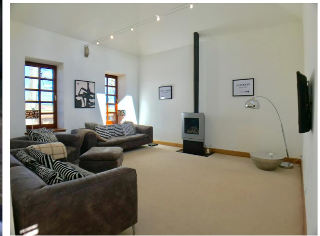
1 The Stables, Monifieth, Dundee