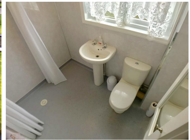
Keir Hardie Court, Beith