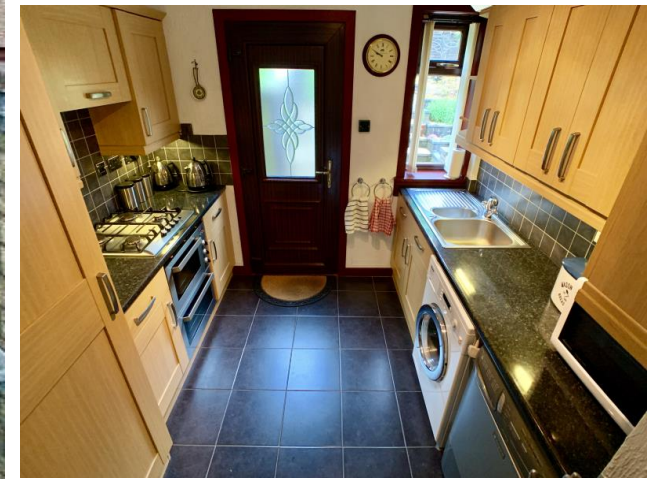
18 Rowan Avenue, Beith