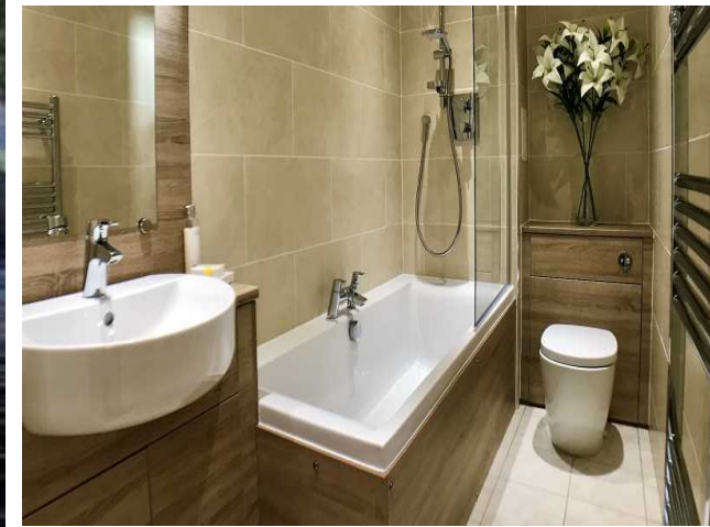
Plot 37 The Waterfront Apartments, Dundee, DD1 4XB