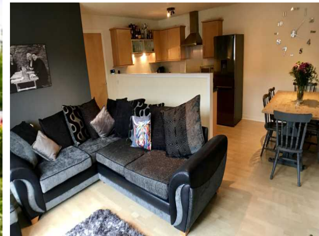
Saucel Crescent, Paisley