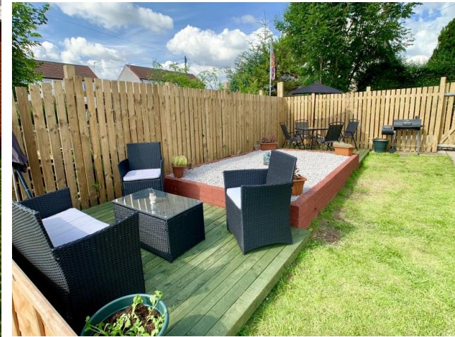
119 Auchenhove Crescent, Kilbirnie