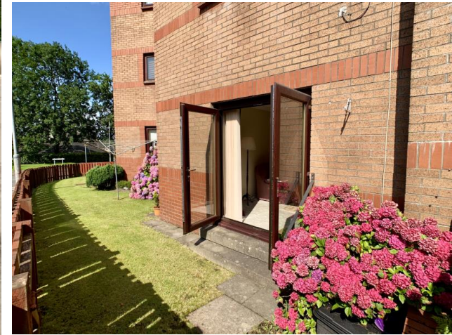
6 Medine Court, Beith