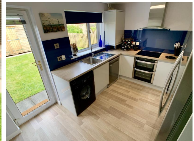
19 Glebe Court, Beith