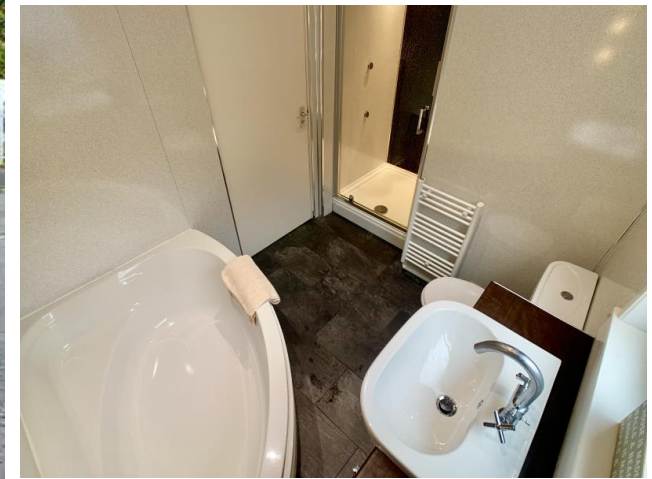
6 Station Court, Glengarnock