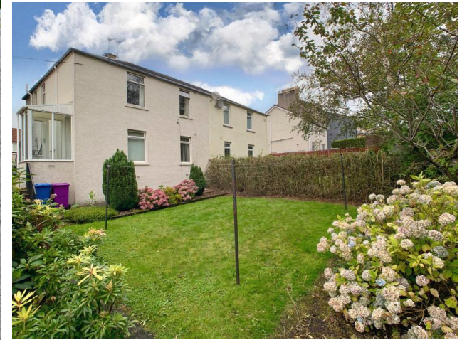
24 Townend Street, Dalry