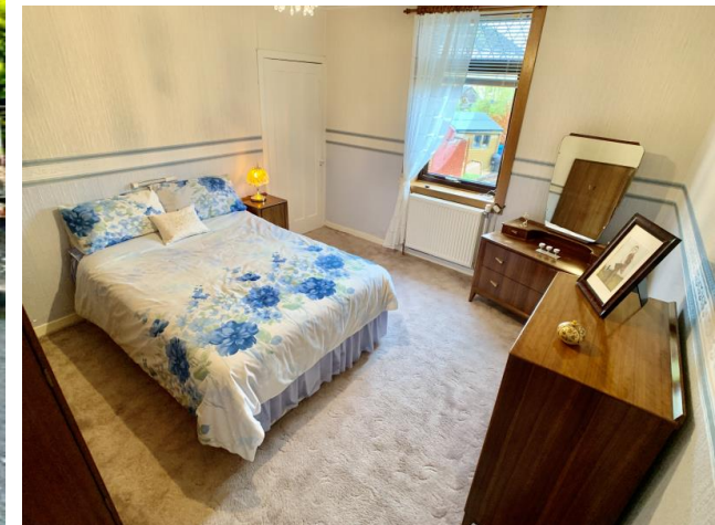
8 Parkhouse Drive, Kilbirnie