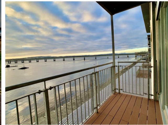
28 Marine Parade Walk, Dundee