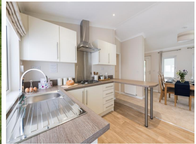
The Newmarket Willow Park Burnhouse, Beith