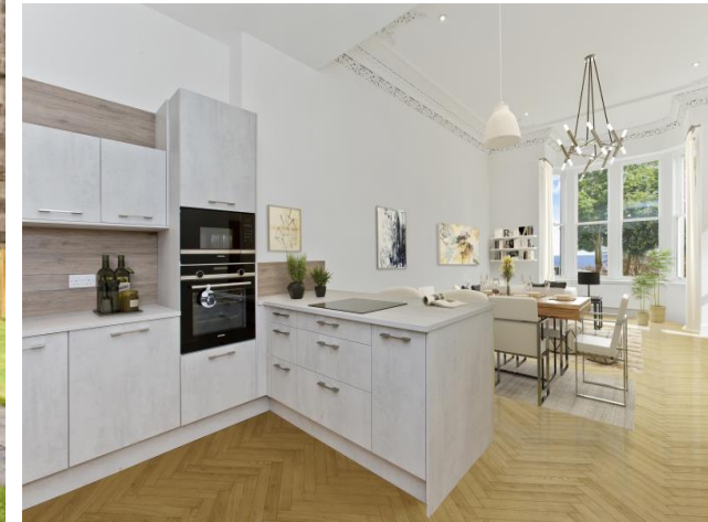
Seaview Manor 11 Lairds Walk House 3, Monifieth