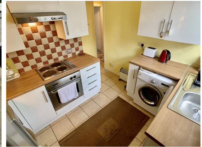
11 Mains Road, Beith