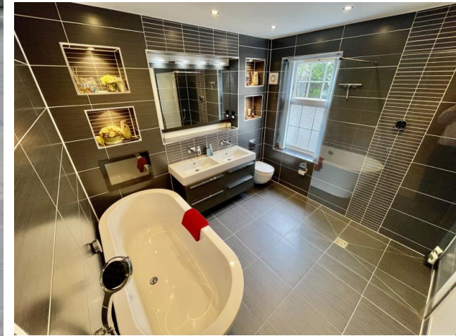
1D Calderhaugh Mill, Lochwinnoch